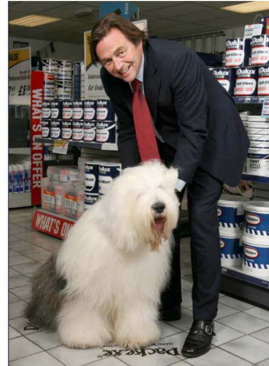
Taking care of the Dulux dog, UK