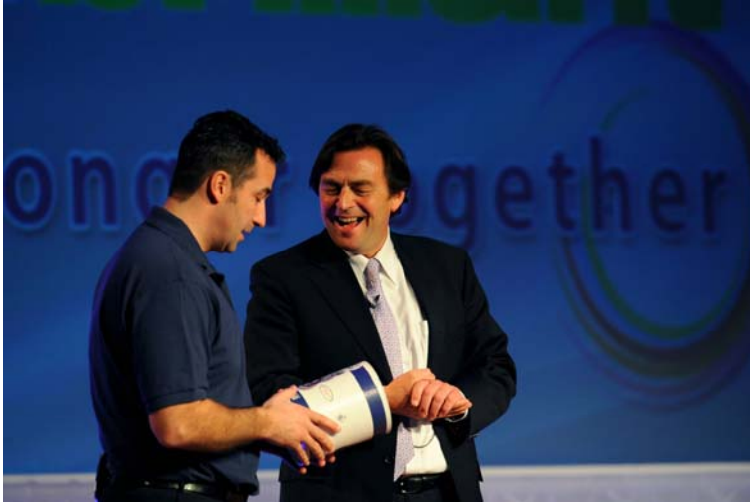
Stronger together – visiting Canada, US and Dublin