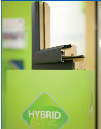
SAS Hybrid window - an eco-efficient combination of real wood and aluminium

nance to protect it over while it is in use.